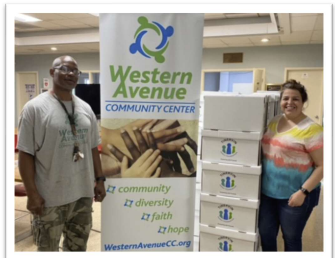
Western Avenue partners with TFF on food distribution

The Foundation has worked to enhance our current programs and initiatives by expanding our partnerships. These partnerships help increase resource access to underserved children and families in our community. We will continue to partner with the Midwest Food Bank for our mobile food distribution programs. We added Western Avenue as a new partner to assist our mobile food distribution operation. Delivering food directly to underserved