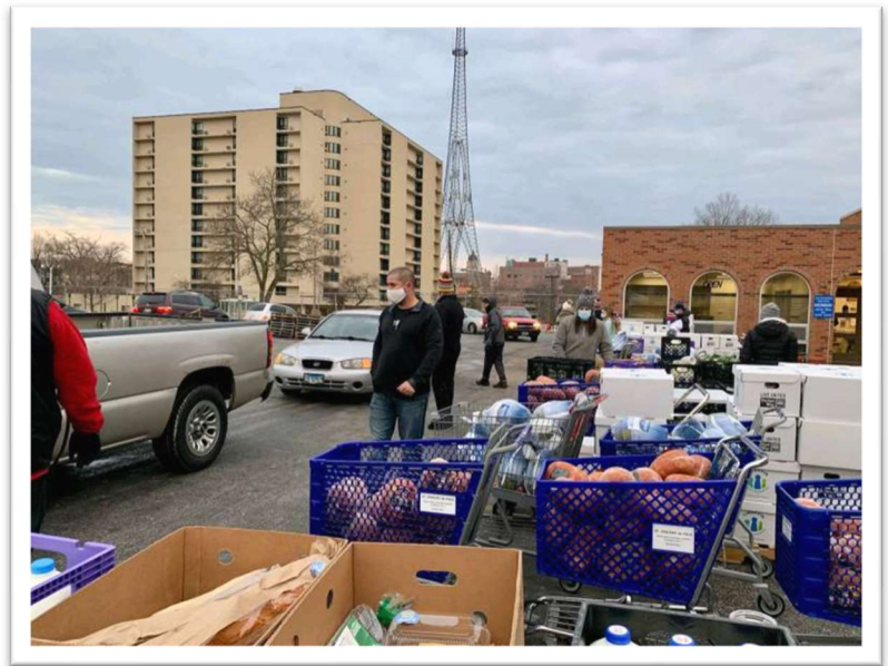
TFF volunteers distributing food boxes during Christmas 2020