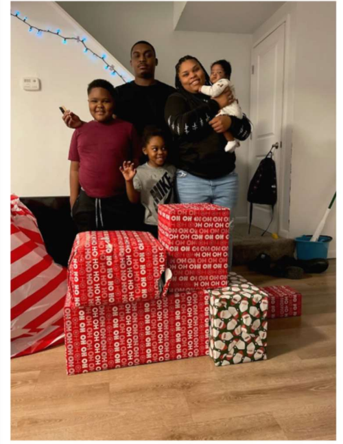
Another client family with their Christmas gifts

Families are chosen from programs the Foundation partners with throughout the year including: Healthy Beginnings, Boys and Girls Club of Champaign, Western Avenue Community Center, and MCCA. Here are two of the 59 families adopted this year as well as some of our volunteers!