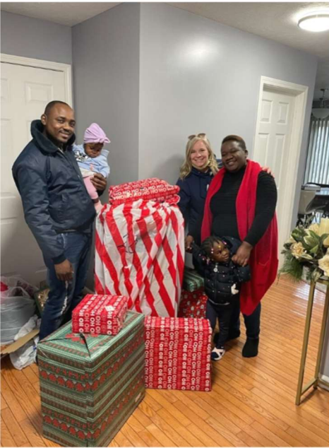
Client family receiving their Christmas gifts

For the past four years, the Tinervin Family Foundation has sponsored the Adopt A Family program. This program identifies families that might otherwise not have the ability to have a Christmas and provide them with household items, clothing, and other essential items they can't obtain themselves.