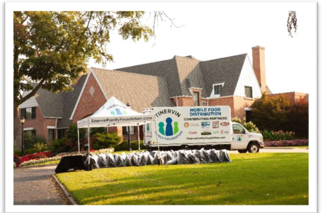
2021 Tinervin Golf Classic

Save the date for next year's event: Monday, September 12, 2022