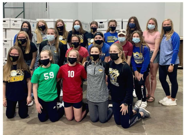
Volunteers after a successful pack night

This is achievable thanks to our amazing volunteer network, our devoted financial supporters, and our strategic partners. During end of 2021 our board voted to provide $150,000 to the renovation and restoration of the Western Avenue Community Center and $50,000 for its operating budget in 2022. In addition, several strategic partners are contributing as well. Stay tuned for updates on the progress!