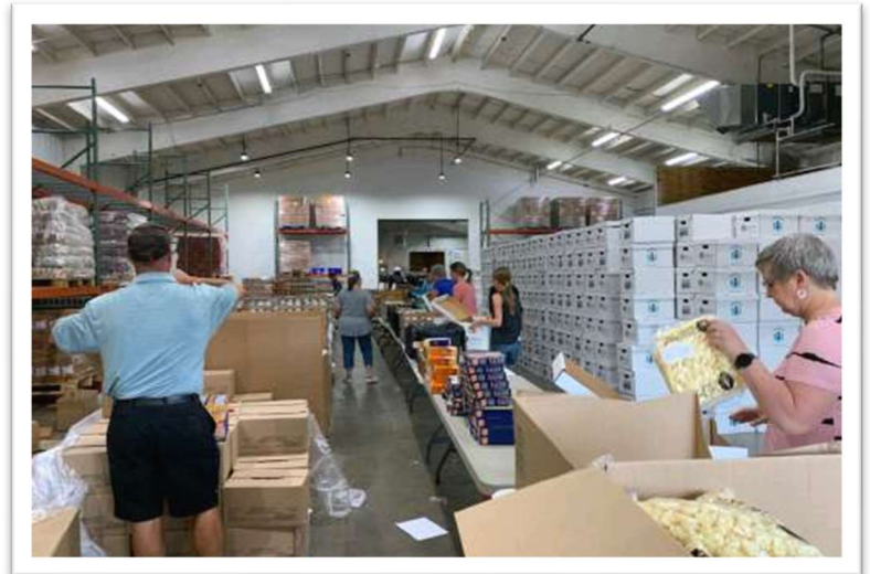
Volunteers packing food boxes on a pack night