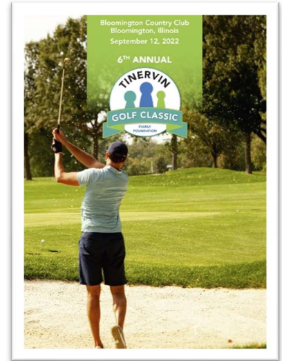
2022 Tinervin Golf Classic

Save the date for next year's event: Monday, September 11, 2023