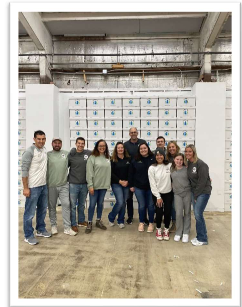
Volunteers after a successful pack night

If you or groups you're involved with are interested in helping pack boxes, please visit our website: www.TinervinFamilyFoundation.com or visit our Facebook page: https://www.facebook.com/Tinervin-Family-Foundation-106257791039704/