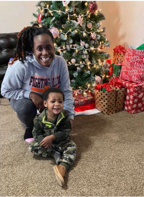
2022 Client family with their Christmas gifts

For the past five years, the Tinervin Family Foundation has sponsored the Adopt A Family program. This program identifies families that might otherwise not have the ability to have a Christmas and provide them with household items, clothing, and other essential items they can't obtain themselves.