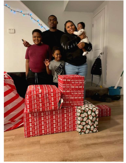
2021 Client family with their Christmas gifts

Families are chosen from programs the Foundation partners with throughout the year including: Healthy Beginnings, District 87/Unit 5 schools, Milestones daycare., Western Avenue Community Center, and MCCA. This year we adopted 69 families!