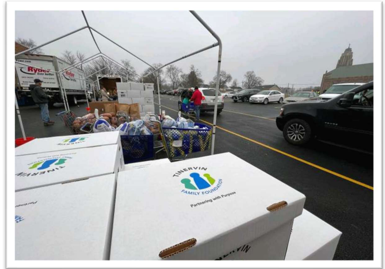
TFF volunteers distributing 2022 Christmas food boxes