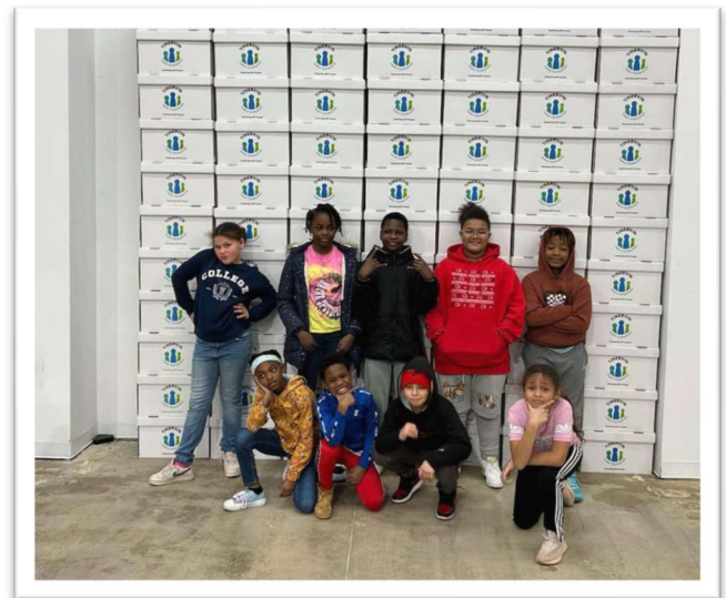
Volunteers from Western Avenue Community Center

If you or groups you're involved with are interested in helping pack boxes, please visit our website: www.TinervinFamilyFoundation.com or visit our Facebook page: https://www.facebook.com/Tinervin-Family-Foundation-106257791039704/