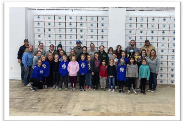
TFF volunteers after packing food boxes

The Tinervin Family Foundation and First Site are each contributing $8,000 and sponsoring a student in UW’s Workforce 180 program. The program helps students with things like tuition, transportation, and daycare. It is designed to helps participants develop skills and experience to enter the workforce and become self-sufficient and thriving individuals. The United Way is actively looking for more sponsors to participate in the program.