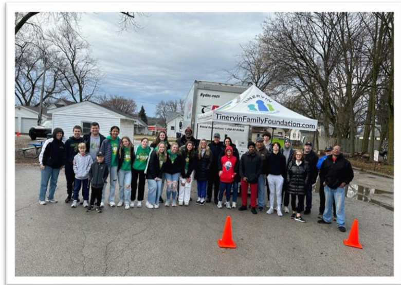
TFF volunteers distributing 2023 Christmas food boxes