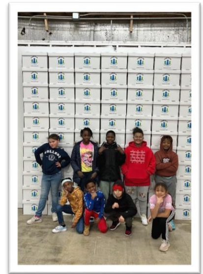
Western Avenue volunteers after a successful pack night

If you or groups you're involved with are interested in helping pack boxes, please visit our website: www.TinervinFamilyFoundation.com or visit our Facebook page: https://www.facebook.com/Tinervin-Family-Foundation-106257791039704/