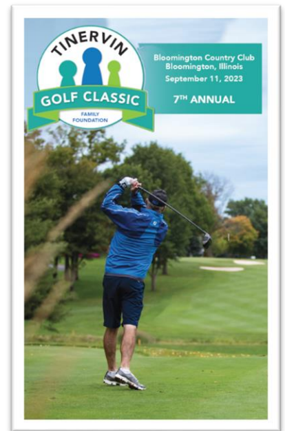
2023 Tinervin Golf Classic

This event continues to help us provide critical services to the community and generate awareness of our mission and initiatives. As always, we provide our services and initiatives without paid employees or office expenses, so every dollar we raise from this event goes directly to our community in need.